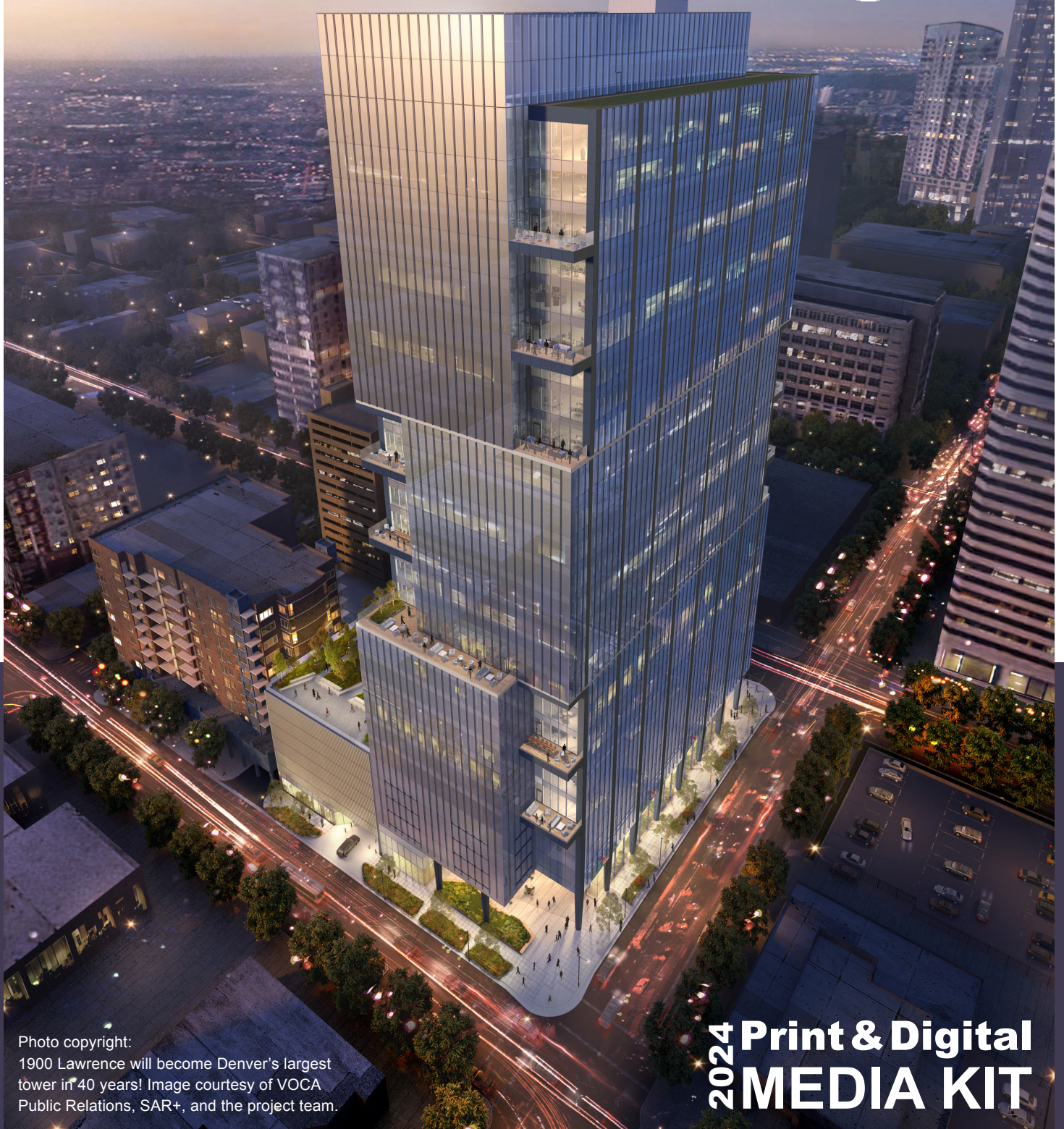
1900 Lawrence will become Denver's largest tower in 40 years!