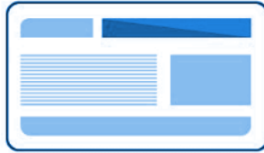
Leaderboard - 728 x 90